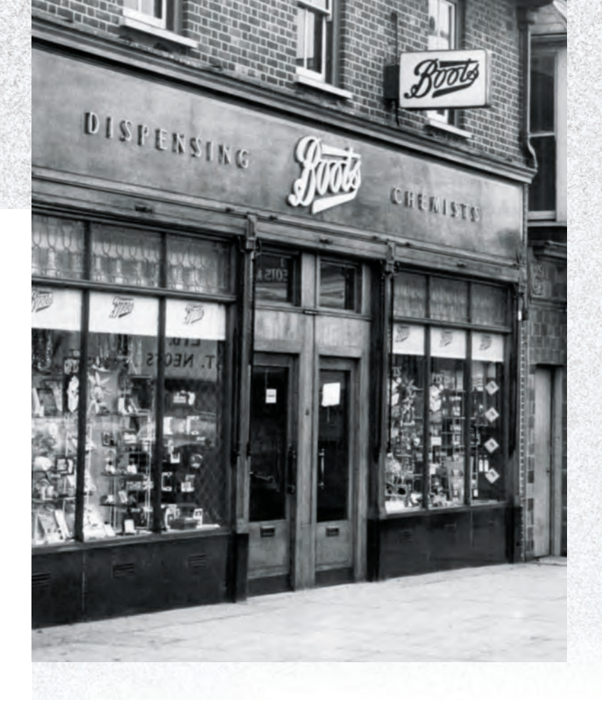
BOOTS, OLD AND NEW: LEFT, A BOOTS OUTLET IN 1962; BELOW, A MODERN STORE, WITH CUSTOMERS LINING UP TO BUY THE COMPANY'S POPULAR NO7 BEAUTY PRODUCTS.